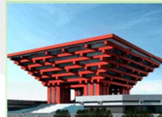
Fig. 5. 2010 ORT Conference will take place in Shanghai from June 26-28, 2010.

2. July 2010: ICHTS will co-organize 2010 Shanghai Orthopaedic Biomechanics Workshop (OBW) with Shanghai Jiaotong University in July 23-24, 2010 (Fig. 6)