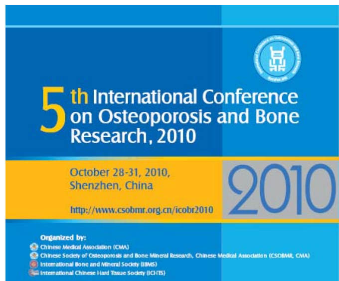
Fig. 7: ICOBR Flyer that will also be printed at back page in BONE.

c). October 28-30: In collaboration with Chinese Medical Association (CMA) and International Society of Bone and Mineral Society (IBMS), ICHTS will organize 2010 ICOBR in Shenzhen, an important economic special region next to Hong Kong and Macao. Details of 2010 ICOBR are available at homepages: www.csobmr.org.cn/icobr2010 , www.IBMS.org , or www.ICHTS.org . Abstract submission deadline is July 1 st and accepted abstracts will be published in BONE (Fig. 7).