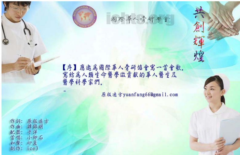
Fig. 4. ICHTS society song. Details are available at ICHTS website www.ichts.org or http://www.liuxueliang.com/huige-2010-tan-xls.htm